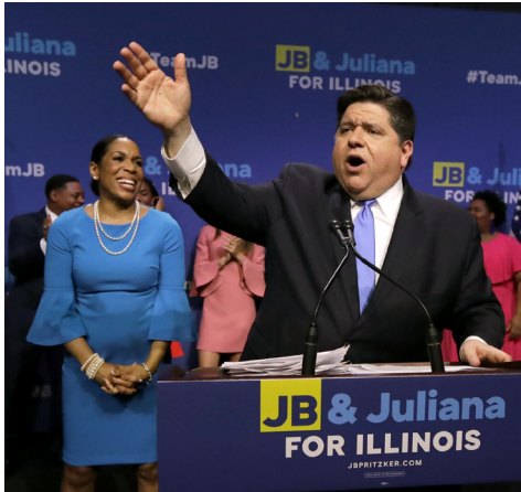
Illinois Governor JB Pritzker

Gov. JB Pritzker won his second term against Sen. Darren Bailey 54.1% to 43.2%. Pritzker's second-term task will be easier by the success of Democrats in the General Assembly.