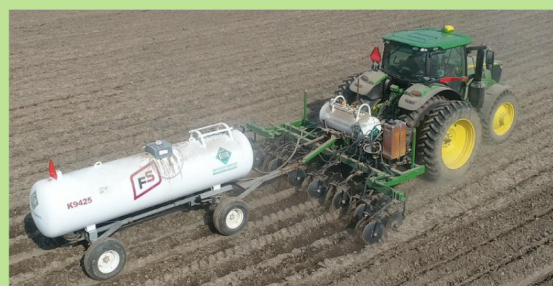
IFCA puts in a spring '18 N treatment in Rockport, IL