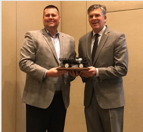
Cong. LaHood receives his “Friend of Ag” Award.